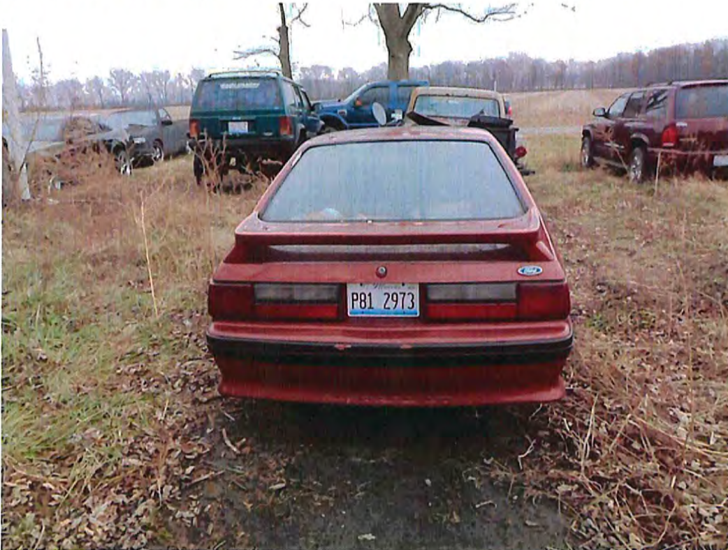
Date: 12/08/2014 Time: 9:39 A.M. Direction: east Exposure #: 014 Comments: registered to Mark Bosecker; plate expired June 2014; waste vehicles in background

File Names: 1858530001~12082014-[001-040].jpg