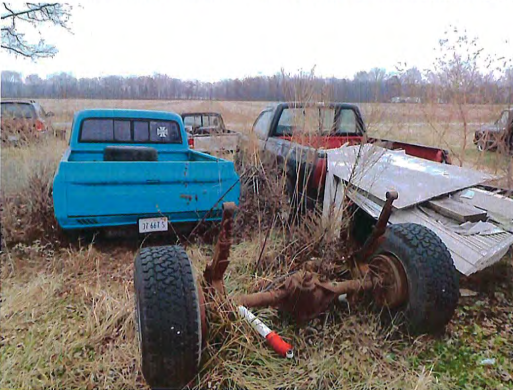
Date: 12/08/2014 Time: 9:39 A.M. Direction: east Exposure #: 016 Comments: waste vehicles

File Names: 1858530001~12082014-[001-040].jpg