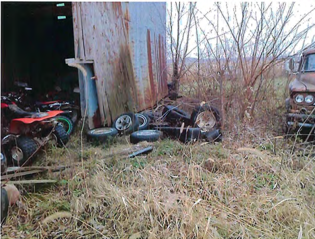
Date: 12/08/2014 Time: 9:40 A.M. Direction: west Exposure #: 020 Comments: used / waste tires

File Names: 1858530001~12082014-[001-040].jpg