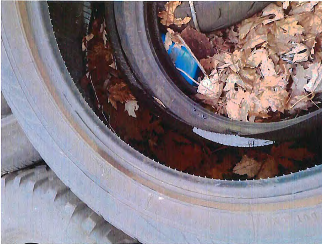
Date: 12/08/2014 Time: 9:42 A.M. Direction: west Exposure #: 035 Comments: water in tire