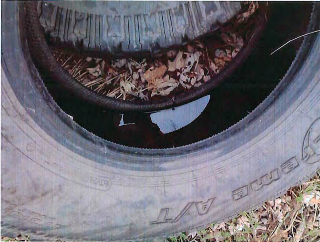
Date: 12/08/2014 Time: 9:43 A.M. Direction: north Exposure #: 037 Comments: water in tire