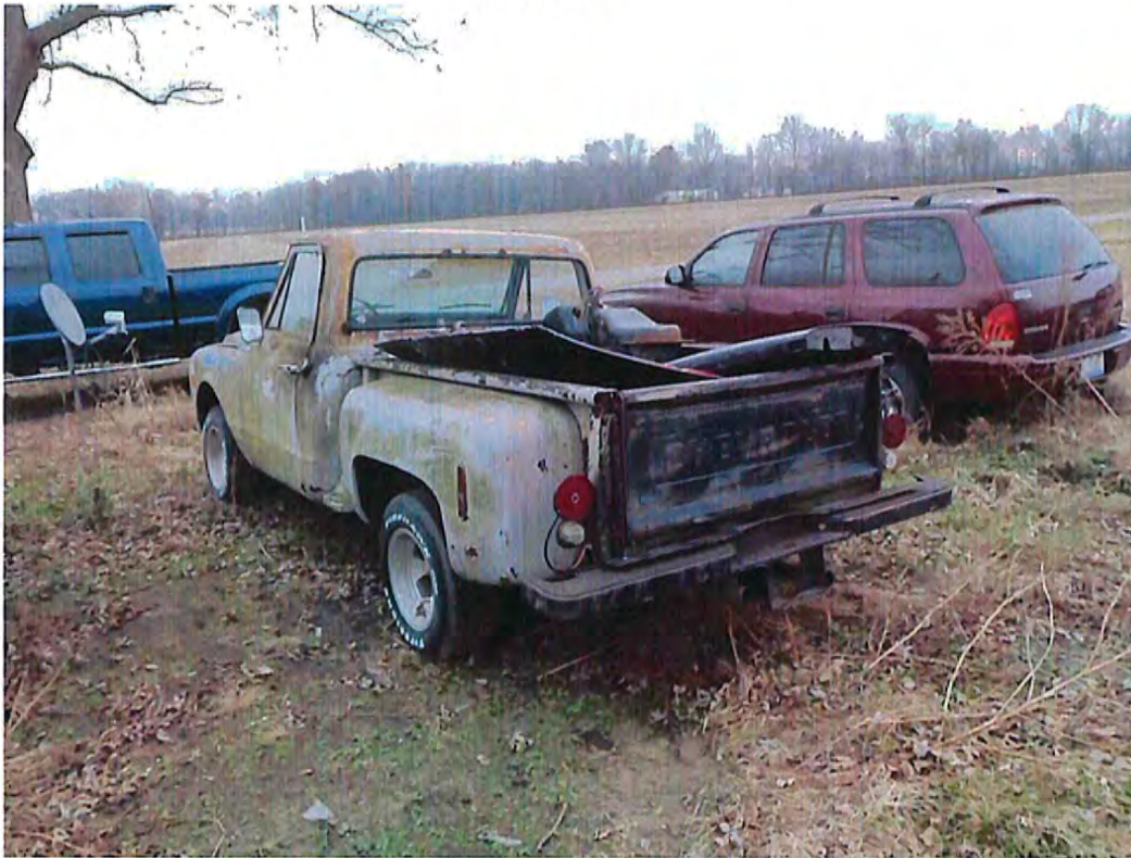
Date: 12/08/2014 Time: 9:38 A.M. Direction: southeast Exposure #: 011 Comments: waste vehicle