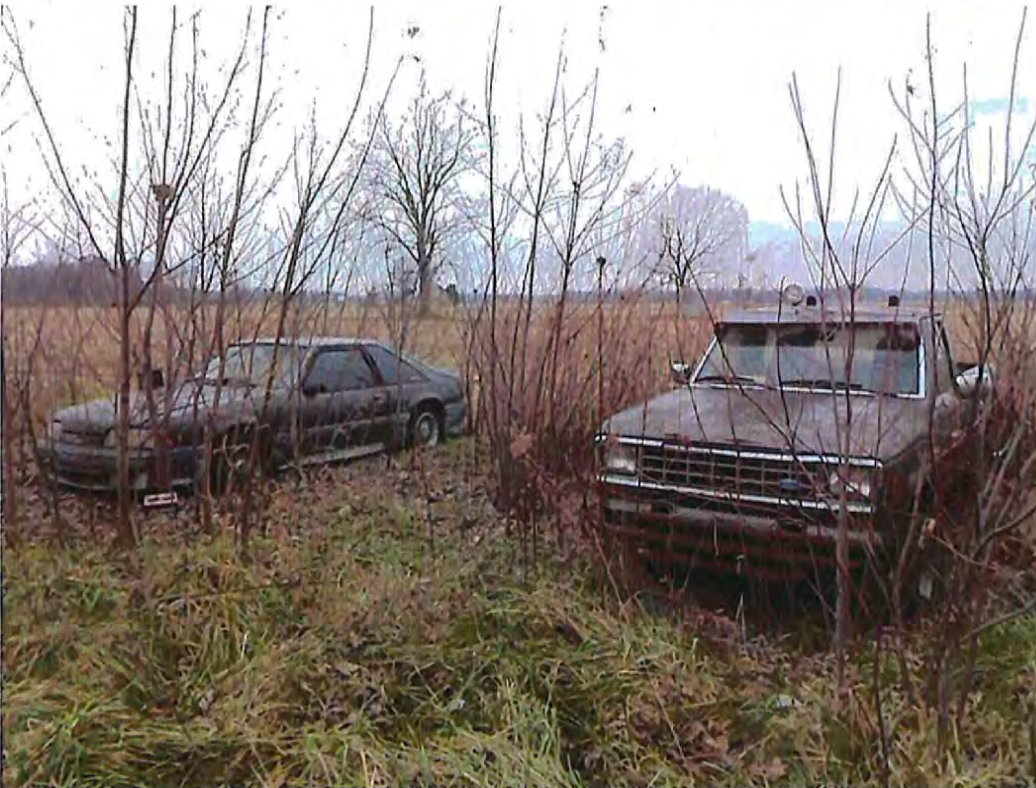
Date: 12/08/2014 Time: 9:41 A.M. Direction: southwest Exposure #: 030 Comments: waste vehicles

File Names: 1858530001~12082014-[001-040].jpg