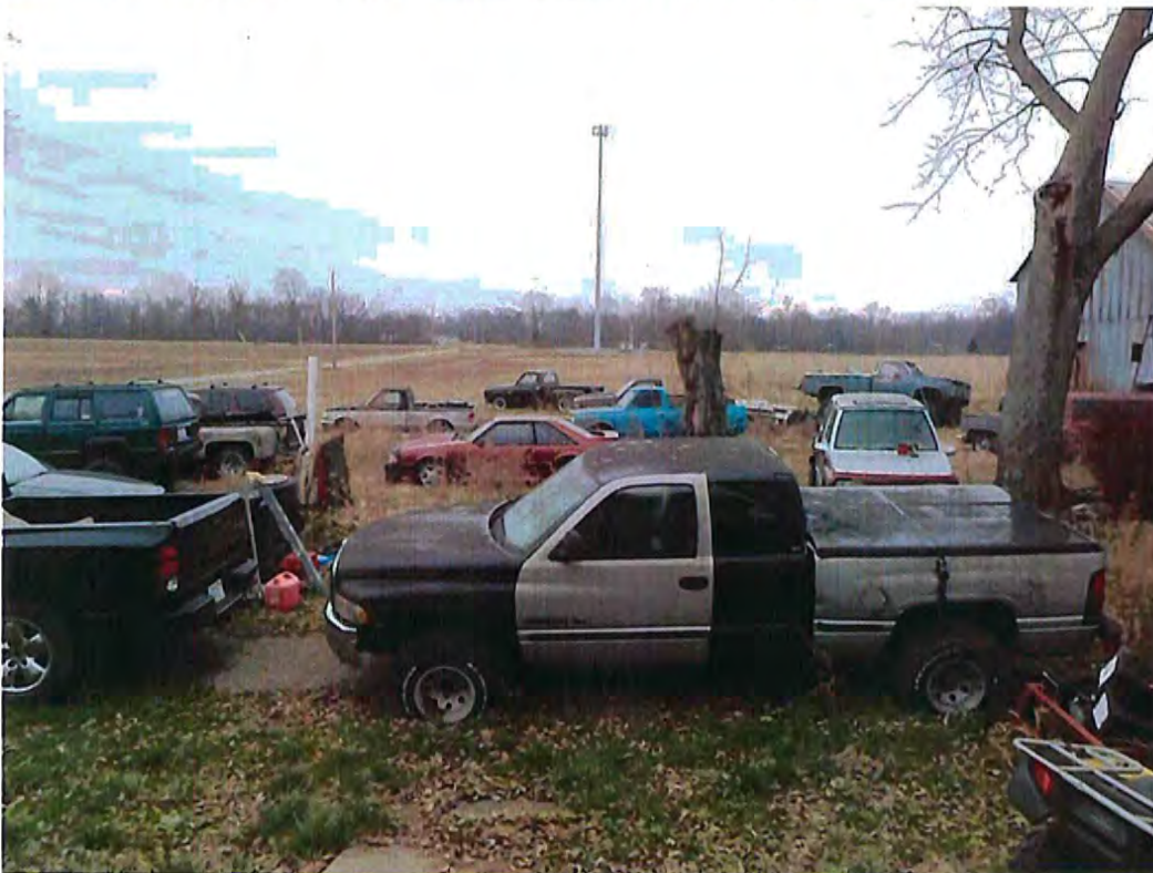
Date: 12/08/2014 Time: 9:38 A.M. Direction: south Exposure #: 008 Comments: waste vehicles

File Names: 1858530001~12082014-[001-040].jpg