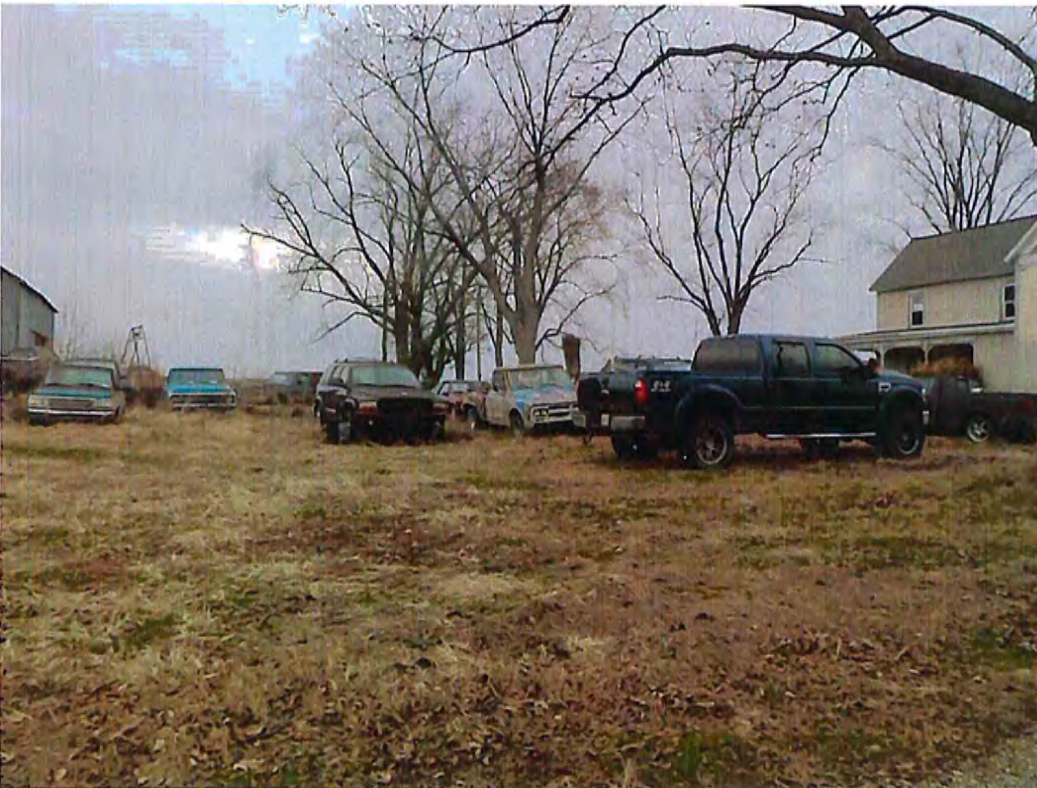
Date: 12/08/2014 Time: 9:35 A.M. Direction: west Exposure #: 002 Comments: vehicles observed from offsite

File Names: 1858530001~12082014-[001-040].jpg