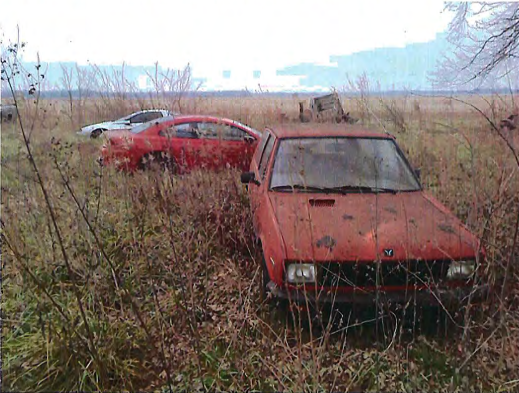
Date: 12/08/2014 Time: 9:41 A.M. Direction: west Exposure #: 026 Comments: waste vehicles

File Names: 1858530001~12082014-[001-040].jpg