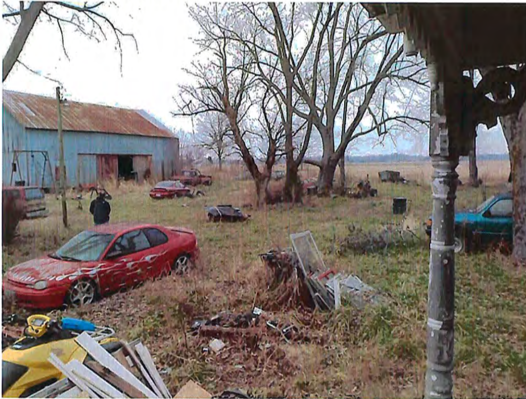
Date: 12/08/2014 Time: 9:38 A.M. Direction: southwest Exposure #: 007 Comments: waste vehicles