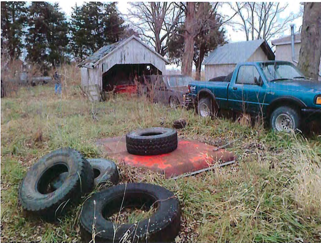
Date: 12/08/2014 Time: 9:43 A.M. Direction: north Exposure #: 036 Comments: waste vehicles

File Names: 1858530001~12082014-[001-040].jpg