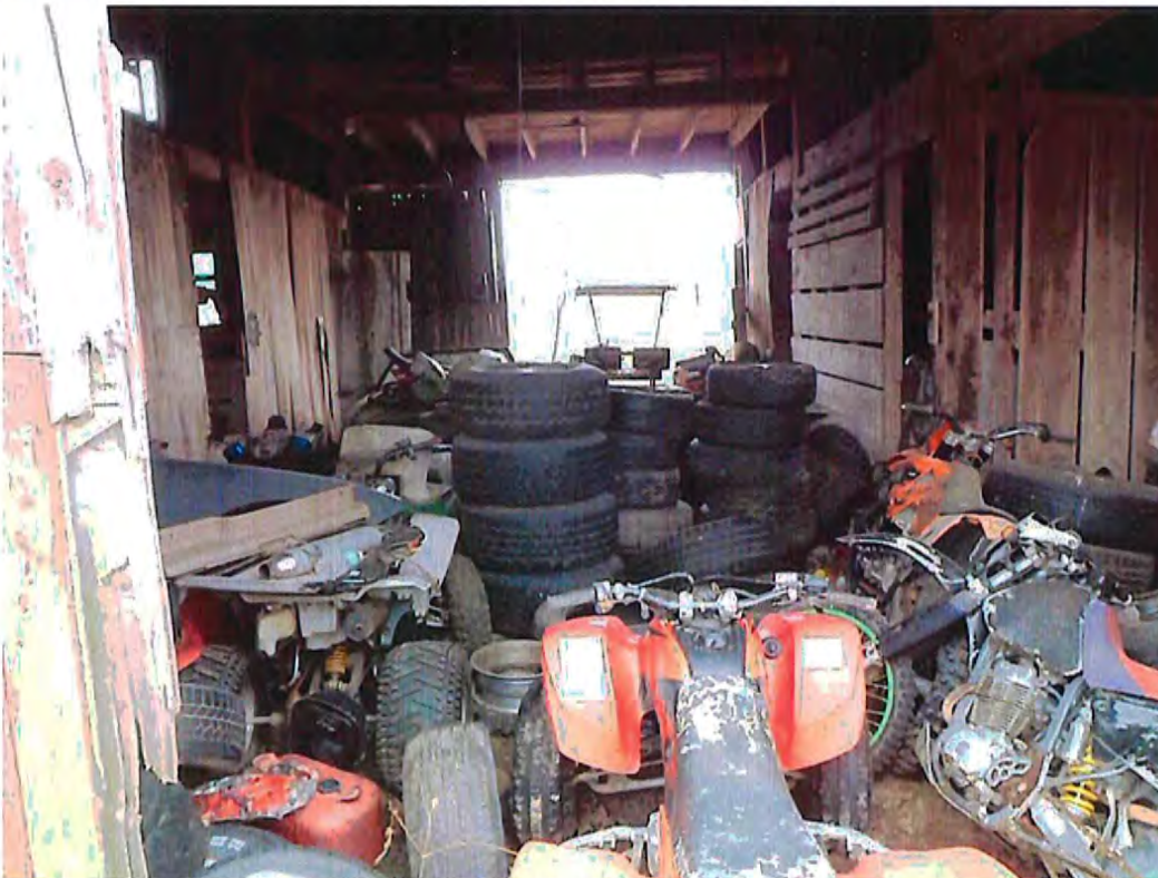
Date: 12/08/2014 Time: 9:40 A.M. Direction: south Exposure #: 022 Comments: used / waste tires

File Names: 1858530001~12082014-[001-040].jpg