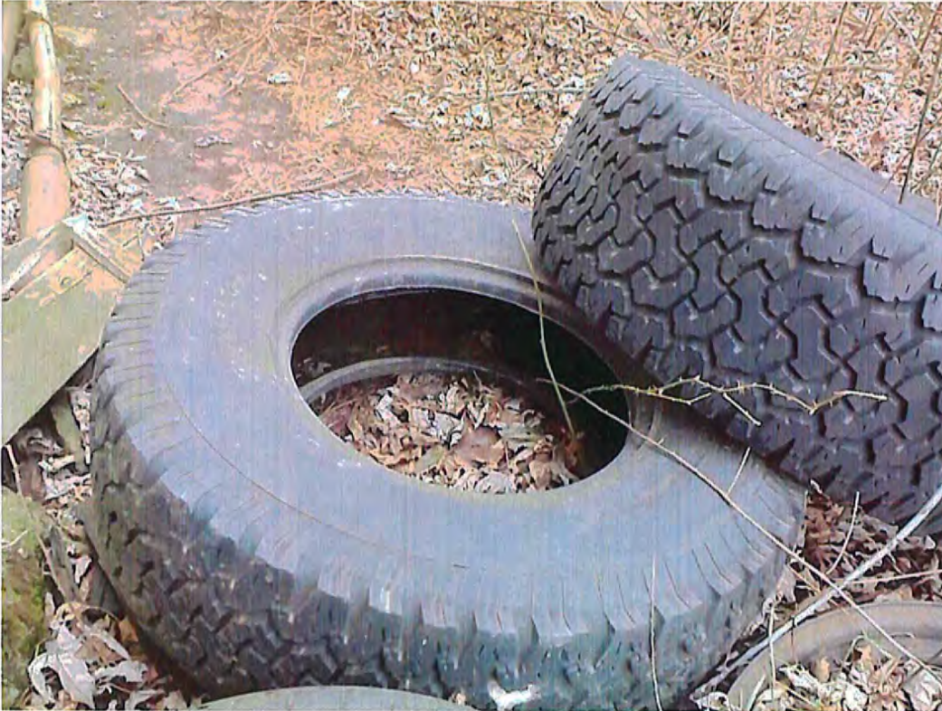
Date: 12/08/2014 Time: 9:40 A.M. Direction: southwest Exposure #: 023 Comments: used / waste tires; water in tire