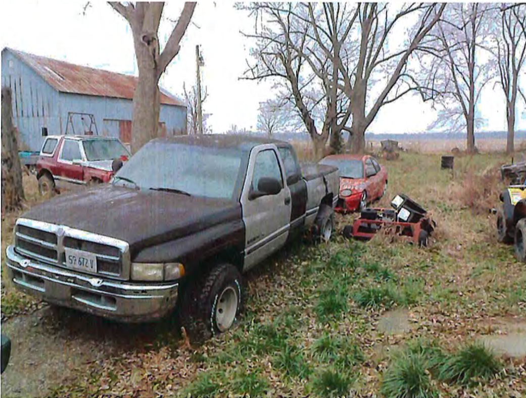
Date: 12/08/2014 Time: 9:37 A.M. Direction: west Exposure #: 006 Comments: waste vehicles

File Names: 1858530001~12082014-[001-040].jpg