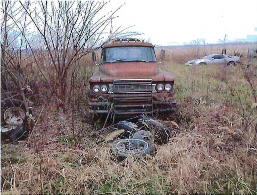
Date: 12/08/2014 Time: 9:40 A.M. Direction: west Exposure #: 021 Comments: used / waste tires; waste vehicle