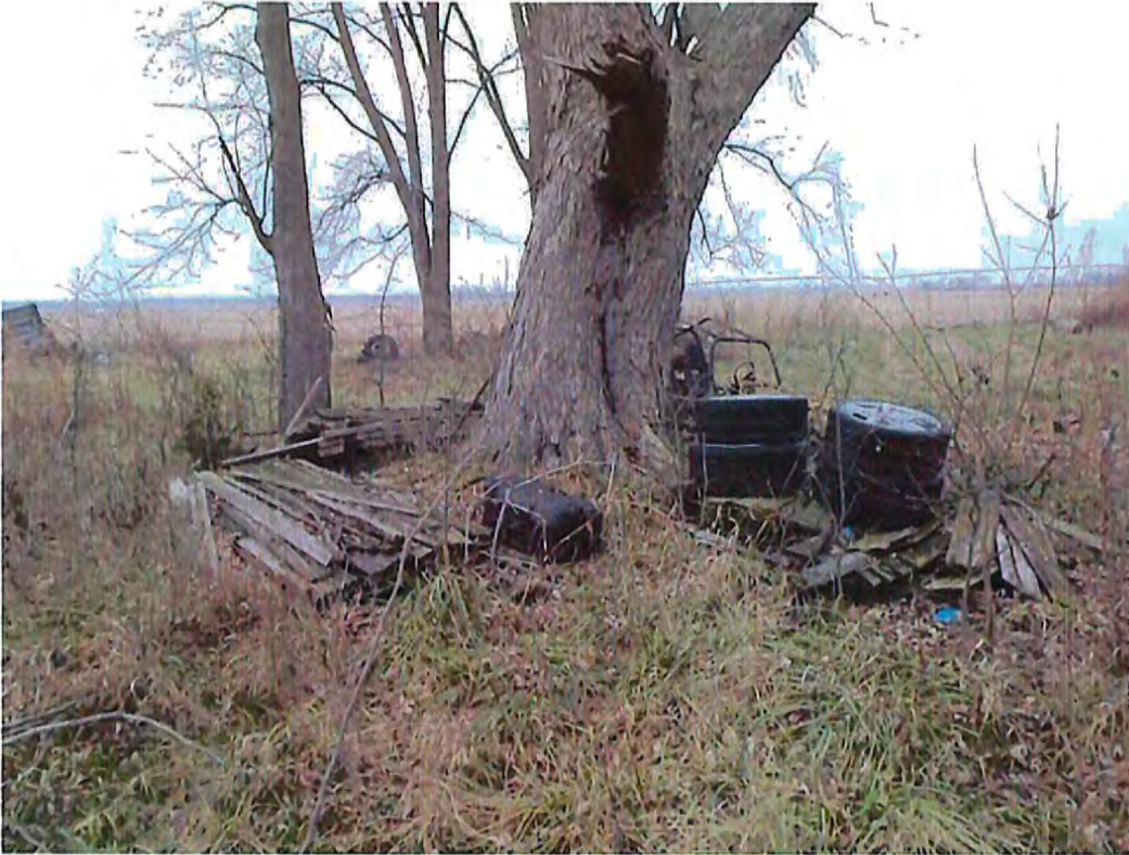
Date: 12/08/2014 Time: 9:41 A.M. Direction: northwest Exposure #: 025 Comments: waste lumber and tires