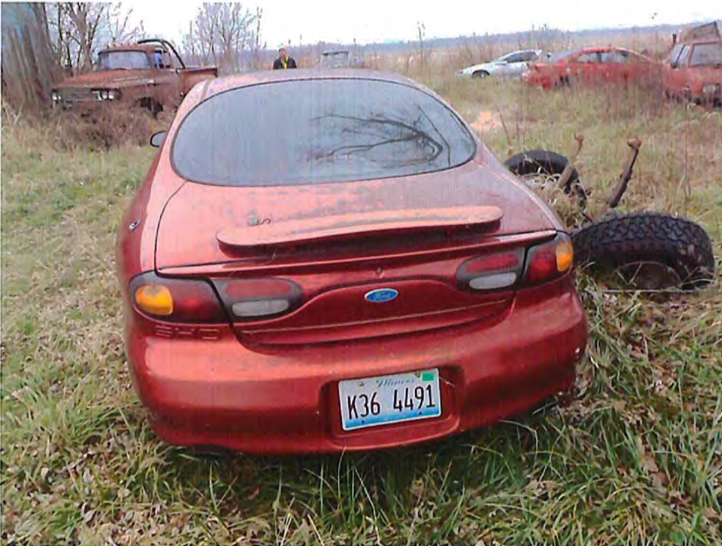
Date: 12/08/2014 Time: 9:40 A.M. Direction: west Exposure #: 024 Comments: waste vehicle; registered to Mark Bosecker; plate expired May 2011

File Names: 1858530001~12082014-[001-040].jpg