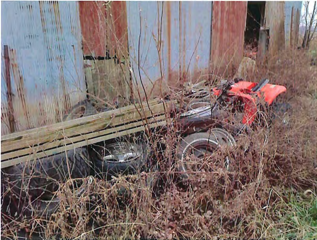
Date: 12/08/2014 Time: 9:40 A.M. Direction: southwest Exposure #: 019 Comments: used / waste tires