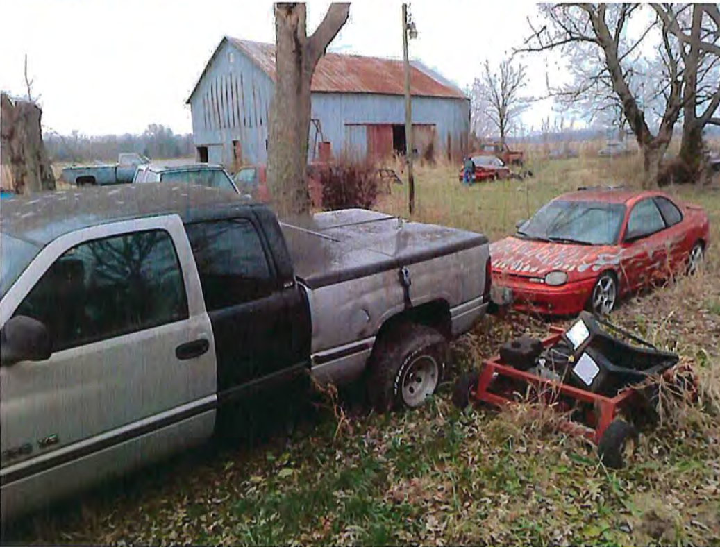
Date: 12/08/2014 Time: 9:38 A.M. Direction: southwest Exposure #: 010 Comments: waste vehicles

File Names: 1858530001~12082014-[001-040].jpg