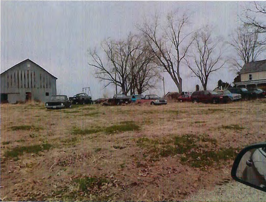
Date: 12/08/2014 Time: 9:35 A.M. Direction: northwest Exposure #: 001 Comments: vehicles observed from offsite