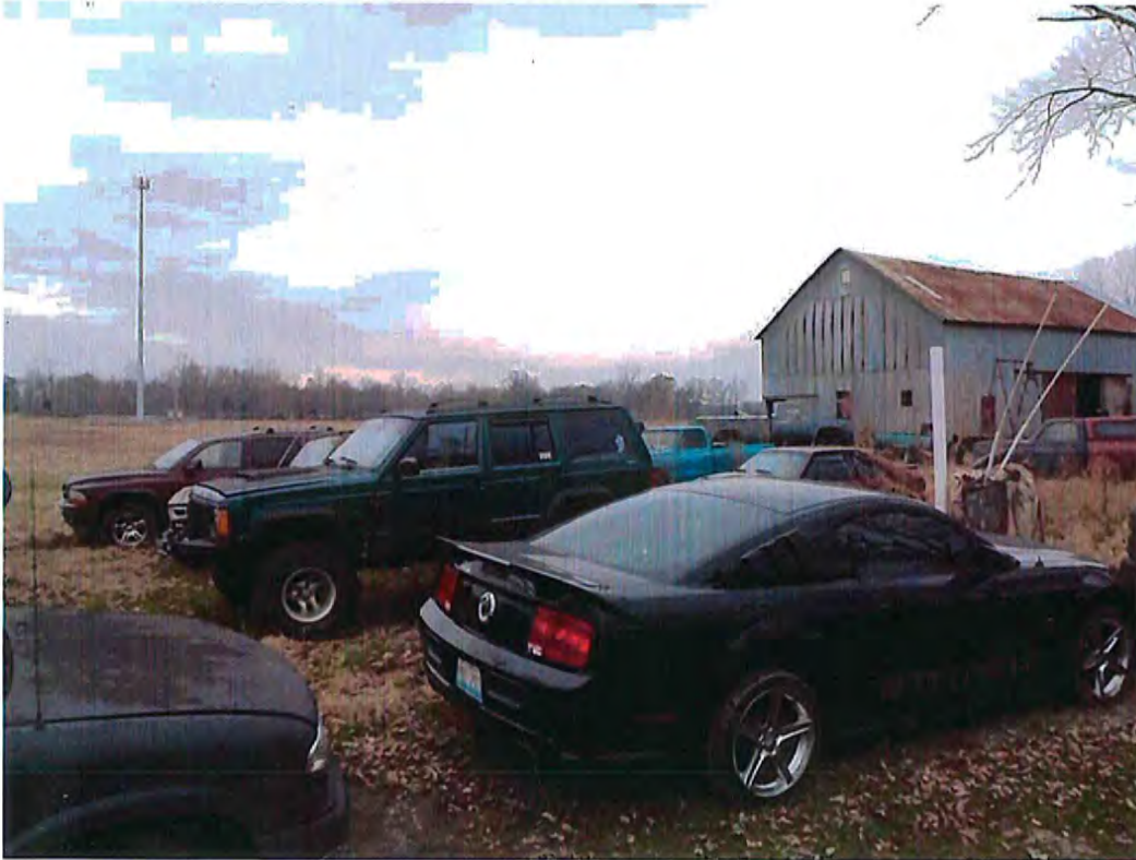
Date: 12/08/2014 Time: 9:37 A.M. Direction: southwest Exposure #: 005 Comments: waste vehicles in background