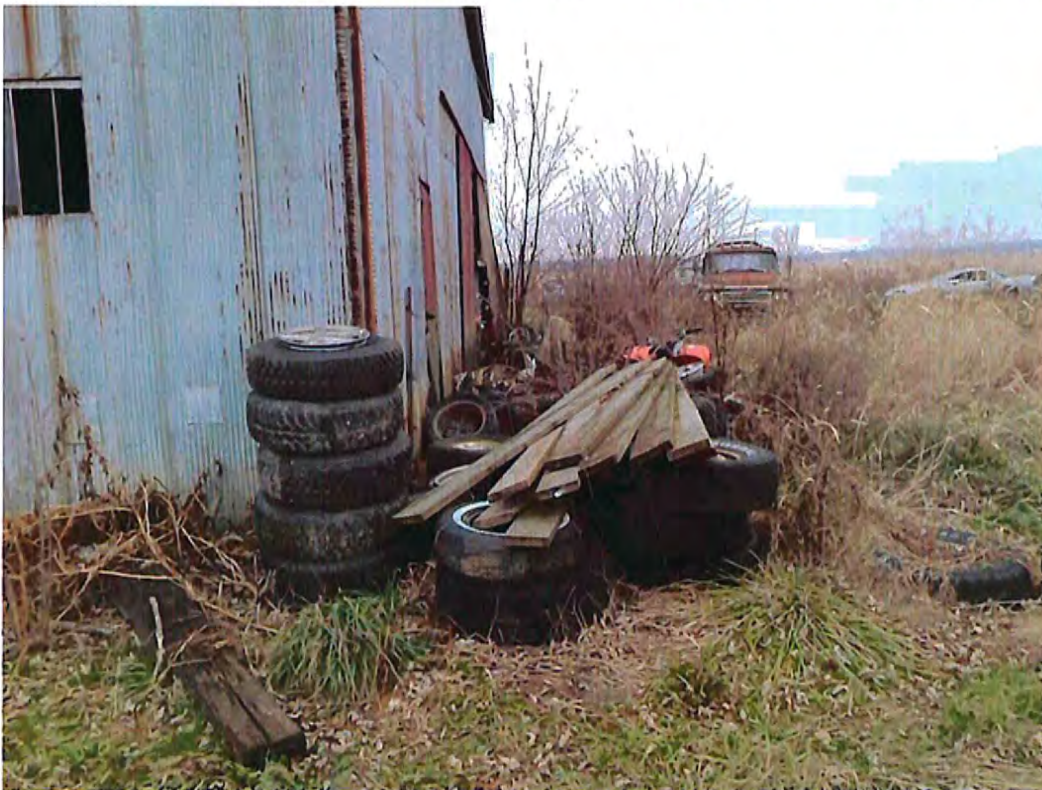
Date: 12/08/2014 Time: 9:39 A.M. Direction: west Exposure #: 018 Comments: used / waste tires

File Names: 1858530001~12082014-[001-040].jpg