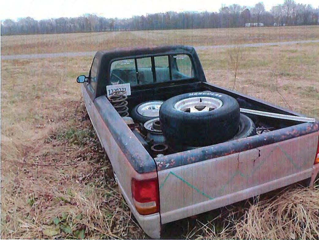
Date: 12/08/2014 Time: 9:39 A.M. Direction: east Exposure #: 013 Comments: waste vehicle