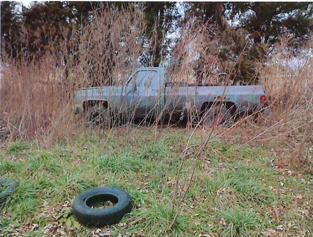
Date: 12/08/2014 Time: 9:43 A.M. Direction: north Exposure #: 038 Comments: waste vehicle

File Names: 1858530001~12082014-[001-040].jpg