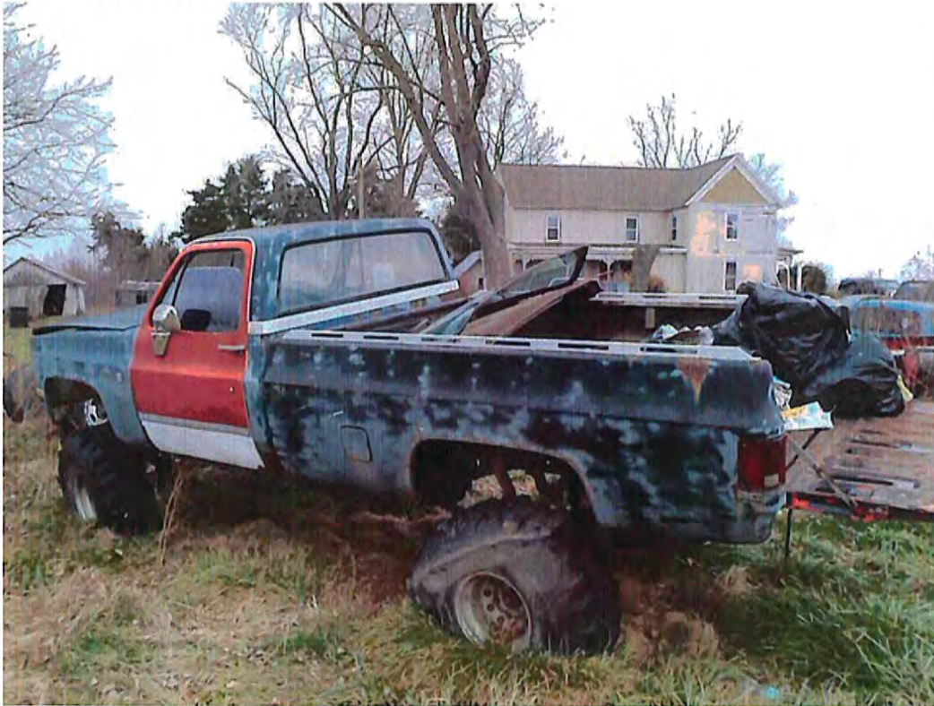
Date: 12/08/2014 Time: 9:39 A.M. Direction: north Exposure #: 017 Comments: waste vehicle