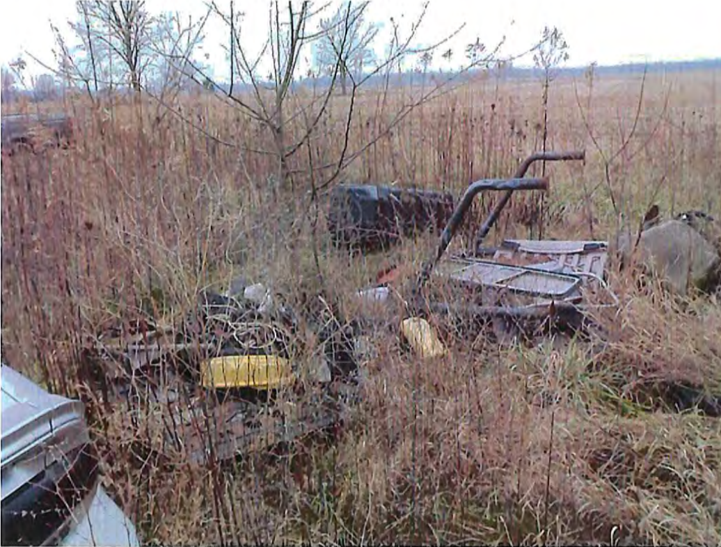
Date: 12/08/2014 Time: 9:41 A.M. Direction: west Exposure #: 029 Comments: waste equipment, vehicle parts and scrap metal