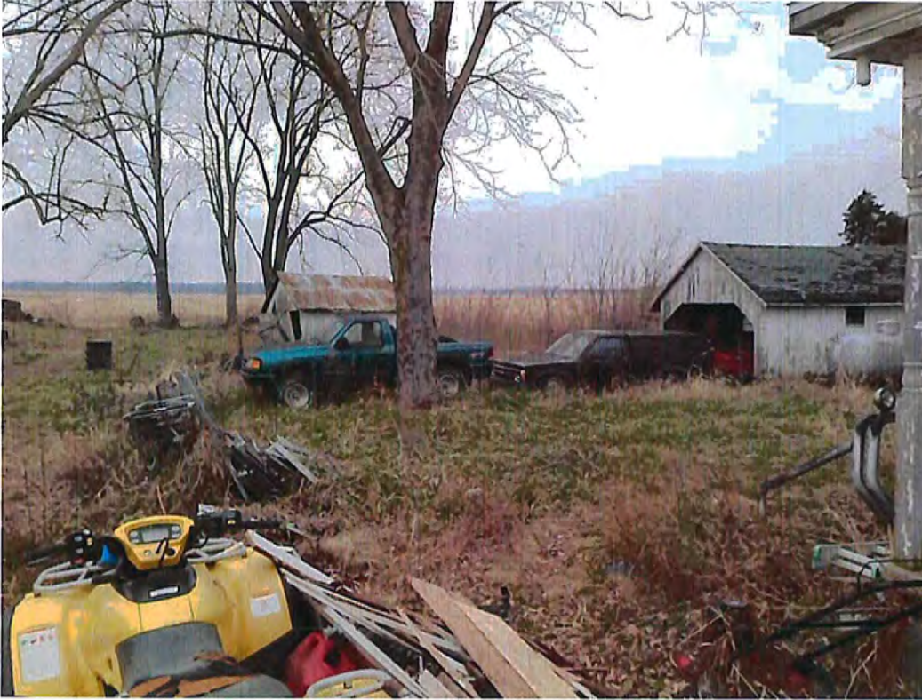
Date: 12/08/2014 Time: 9:38 A.M. Direction: west Exposure #: 009 Comments: waste vehicles